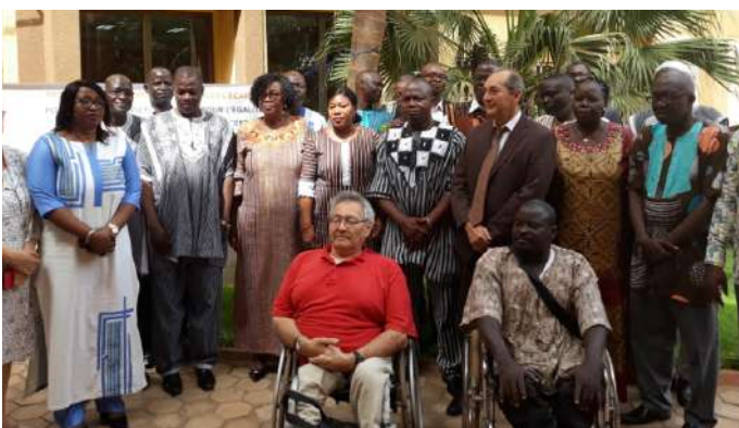
CRPD training in Burkina Faso

During the first year of implementation Bridging the Gap has facilitated the organization of five workshops and seminars on disability mainstreaming in Burkina Faso, Ethiopia and Paraguay; has mainstreamed the disability component into existing international cooperation initiatives and has worked along with the Delegations of the European Union (EUDs) in the five participating countries.