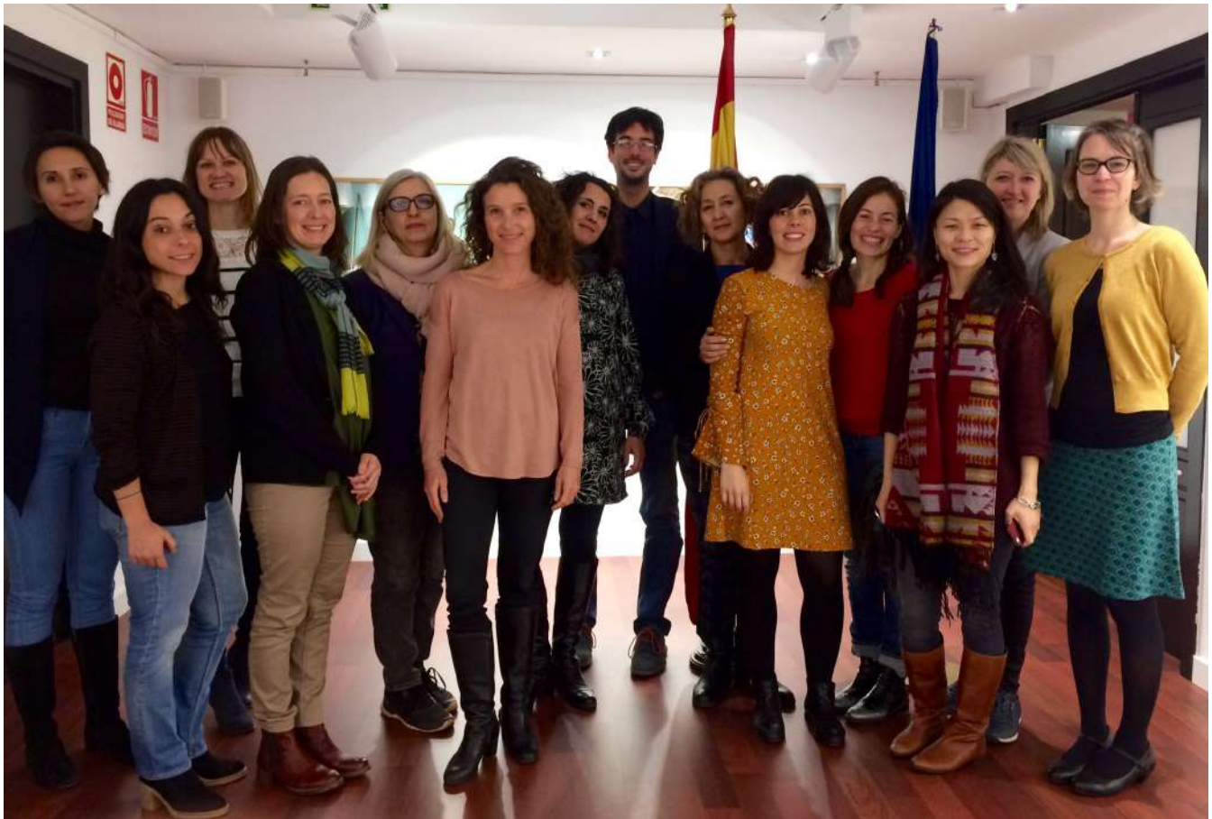
Group photo at the 2nd project steering committee meeting in Madrid, Spain

This publication is a non-exhaustive collection of the main results achieved by the project so far, intended at informing the public about Bridging the Gap and at raising awareness on its content and goals. The aim of this publication is to reach out a growing basis of interested stakeholders.