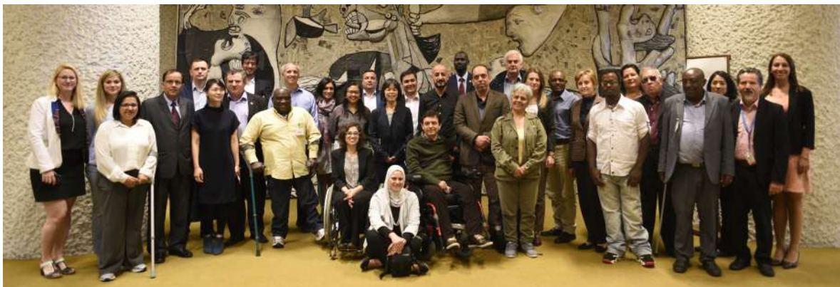
Participants at the 2nd Bridging the Gap I's workshop in Geneva

Work has also commenced on drafting guidelines for policymakers concerning the implementation of the SDGs guided by the CRPD. These guidelines address each goal to highlight the steps policymakers need to take to achieve the targets of the goal as it relates to persons with disabilities, informed by the CRPD and other human rights standards and their elaboration by the CRPD Committee, the Special Rapporteur on the rights of persons with disabilities, other human rights mandates and UN agencies. Further, guidelines on data sources are currently being developed to inform the exercise of populating the indicators.