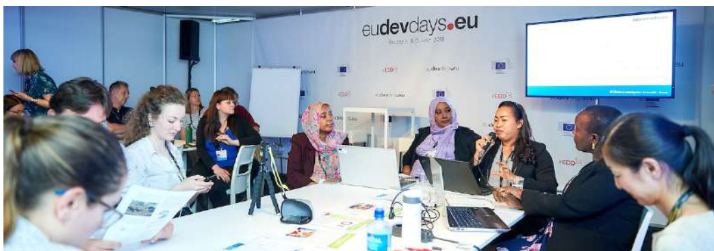
Joint Bridging the Gap, EU-SPS and LftW event at the 2018 EDD

Bridging the Gap, alongside several international organisations of persons with disabilities, is also supporting the efforts of the EDD's organisers to make the event fully inclusive and accessible.