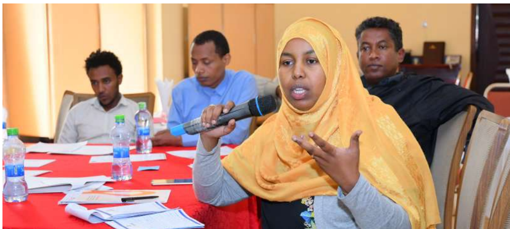
Discussion at a BtG workshop in Addis Ababa, Ethiopia

These and other project activities have initiated a path Bridging the Gap is fully committed to follow for the rest of the project implementation: a path of contribution to more inclusive public policies and services, in line with the provisions of the CRPD and towards a fully inclusive SDG agenda.