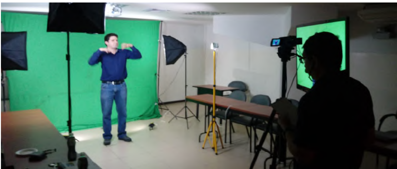
Preparation of learning material for children with disabilities in Ecuador

In Ecuador, the project has supported peer exchanges between the national organisations of persons with disabilities and their correspondent counterparts in Spain, in order to learn from experience and share theirs. The activity, in line with national country action plan, follows up the concession of subgrants for the preparation of learning material for persons with disabilities. This activity is aimed at supporting the national process of reinforcement of inclusive education in the country.