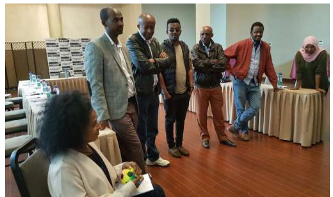
Capacity building in Ethiopia

In Ethiopia, Bridging the Gap has contributed to a human right-specific training addressed at the EUD’s staff by bringing in the disability component and reinforcing the knowledge of practical tools for embedding the “human rights-based approach” in the daily activities of the Delegation.