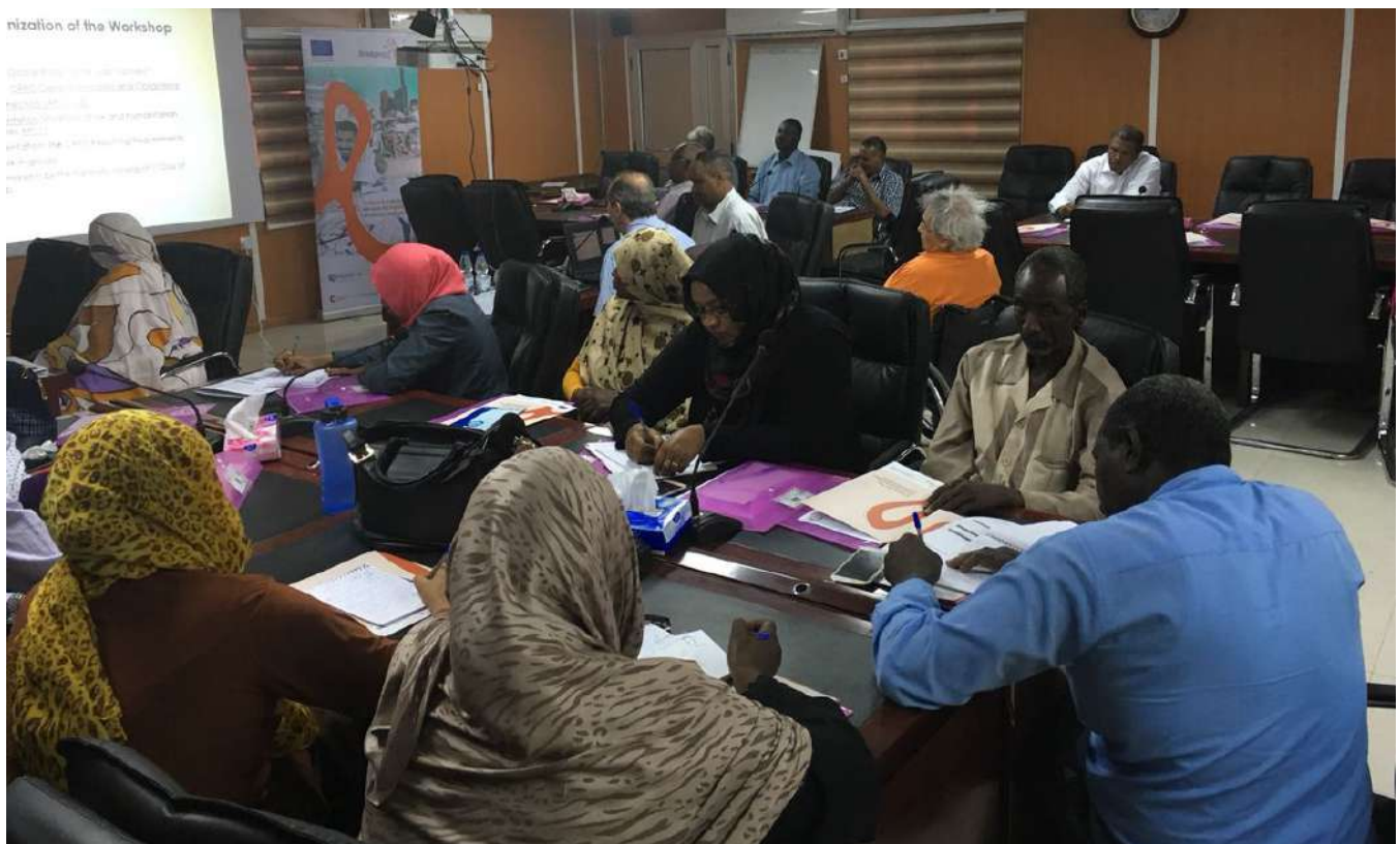
CRPD training in Sudan

Achieving this ambitious objective is a long way to go, but Bridging the Gap has already established some benchmarks for future action. During its first months of implementation, the project has focused on touching base with all the relevant national, regional and local public stakeholders, thoroughly analyzing the baseline situation and implementing some initial activities to raise awareness on the CRPD, the SDGs and on concrete means and examples for their implementation in the partner countries.