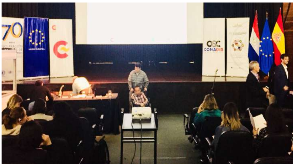
Workshop on disability data and indicators in Paraguay, June 2018

In Paraguay, over 90 persons attended a high-level international workshop organized by Bridging the Gap to present theories and techniques for the collection, analysis and usage of disaggregated data, in line with article 31 CRPD. The seminar helped connecting the dots between already existing tools and database in the country, facilitating the design of a project strategy for the generation and use of disability data.