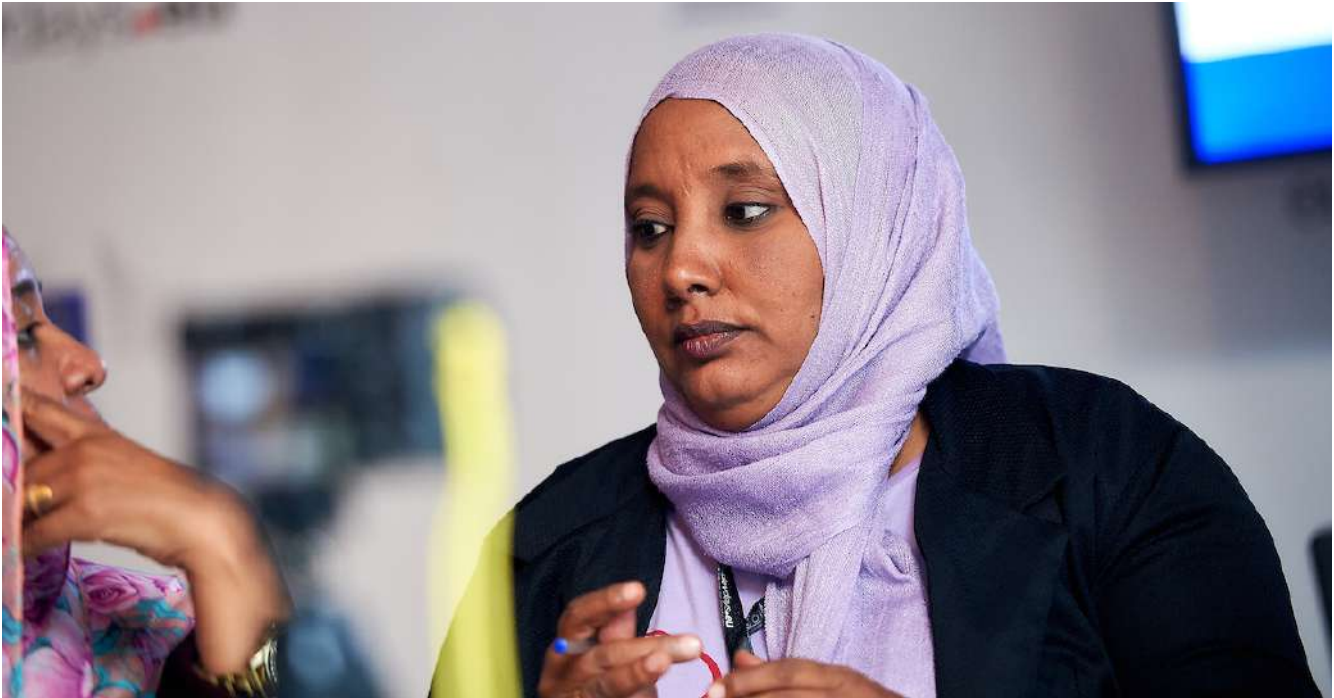
Akhyar Omar speaking at the 2018 European Development Days

Women have been the centerpiece of Bridging the Gap's activities in all participating countries. Notably in Sudan, dedicated vocational trainings and stages in agricultural sector and self-employment for women and girls with disabilities and mothers of children with disabilities in the rural State of Gedaref were organized and later showcased as good practice at the 2018 European Development Days. A follow-up of the activity is currently under planning.